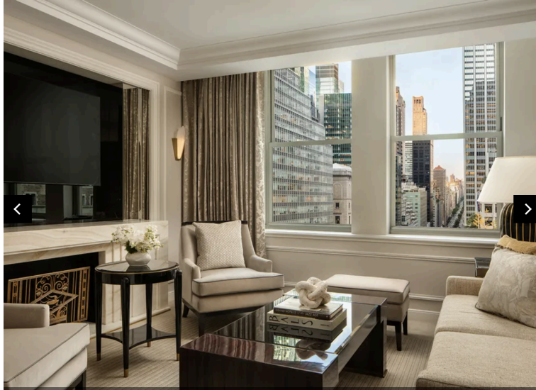
Park Avenue Premier One Bedroom Suite Living Space