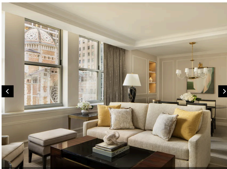
Park Avenue Premier One Bedroom Suite Living + Dining

Covering an entire city block on Park Avenue between 49th and 50th, the Waldorf Astoria New York is enviably located in the heart of Manhattan's business, leisure and culture nexus. Some of the world's finest and most alluring retail therapy sits just steps away on Madison and Fifth Avenues, while Grand Central Station, The Chrysler Building, Central Park, MOMA and Broadway are all less than a mile away.