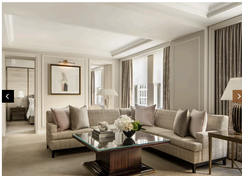
One Bedroom Suite Living Space