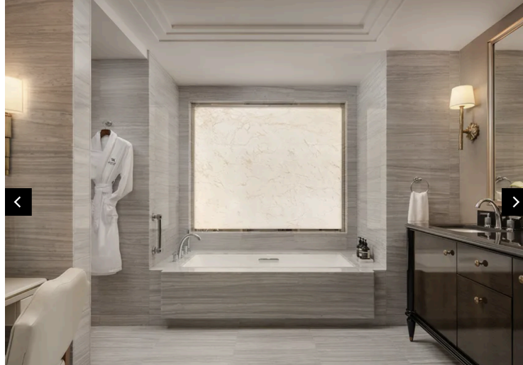
One Bedroom Suite Bathroom

The hotel once had more than 1,400 rooms, but today there are just 375, meaning that they're some of the most generously sized around, starting at 570 sq ft. Separate living, working and sleeping zones mean that all 11 categories of rooms and suites feel like private apartments, with understated design motifs that reflect the hotel's illustrious Art Deco past. There's every comfort you'd expect, seamless tech, dreamy Frette linen beds and spa-like bathrooms with Aseop amenities – and yes, super-soft robes to make @bathrobemafia proud.