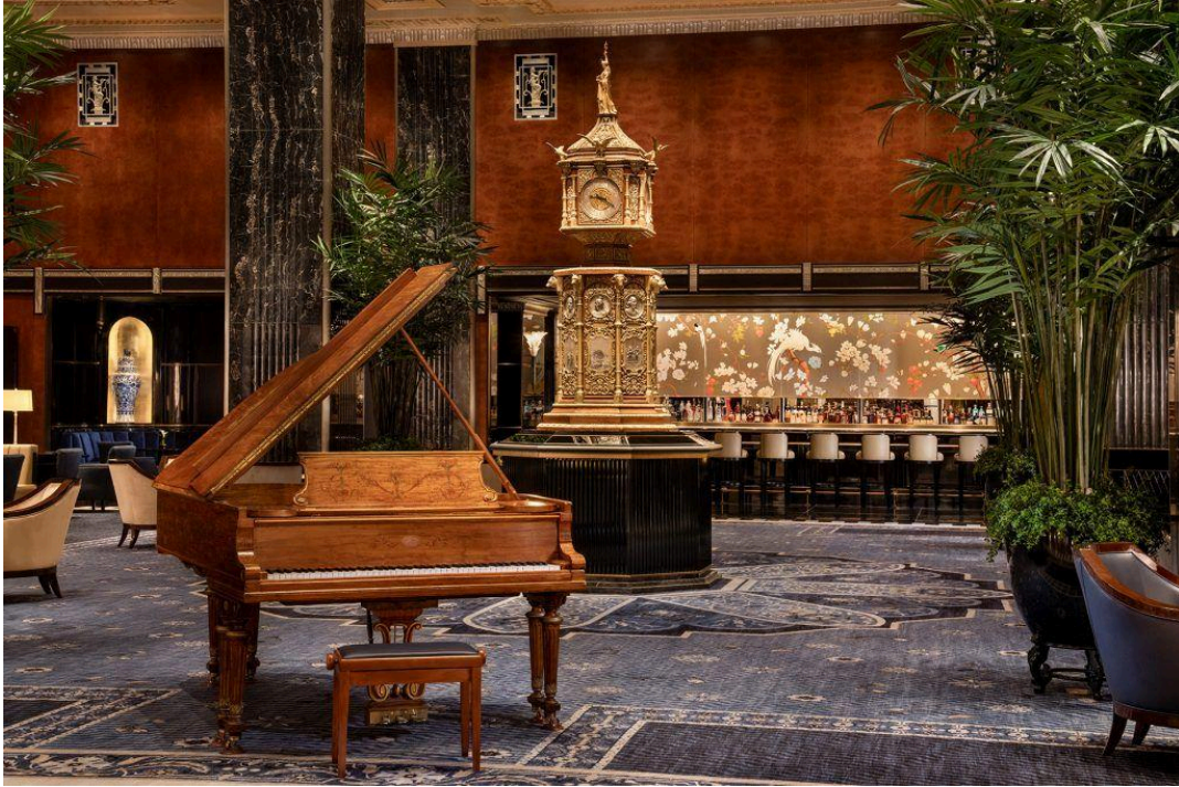
Peacock Alley with Cole Porter Piano

Affluent Manhattanites, Fifth Avenue fashionistas and cosmopolitan international travelers recreate the Gilded Age with a dose of High Society—aptly, given that its famed composer Cole Porter was another longtime former resident. His original Steinway piano, complete with stains from his Martini glasses, is played nightly in Peacock Alley. A shout-out, too, in this pet-friendly property to four-legged guests such as Bonnie, a German shepherd husky cross I met with gorgeous blue eyes.