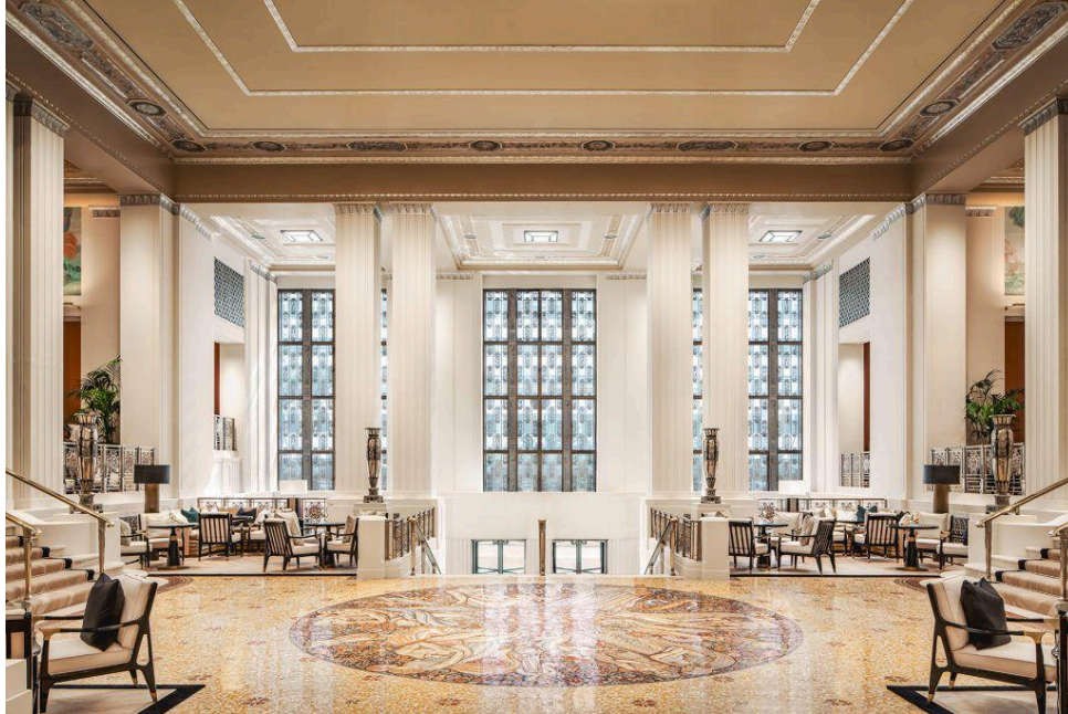
Park Avenue Lobby

That astonishing investment of time and money has resulted in an achingly beautiful restoration of a property which has the magnetic vibe to match its unmatched backstory and refined location. Heritage, luxury and high society combine to sultry effect at the revamped Waldorf Astoria New York, especially in Peacock Alley where people-watching is all the rage—but warm, friendly staff throughout ensure that it never slips into parody.