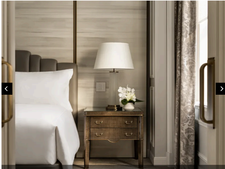
One Bedroom Suite Bedroom