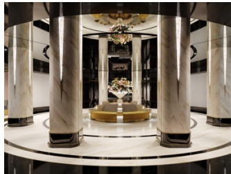
Rendered image of lobby in The Towers of the Waldorf Astoria. The Towers of the Waldorf Astoria

There will be 2 residential lobbies and 6 residential elevators.