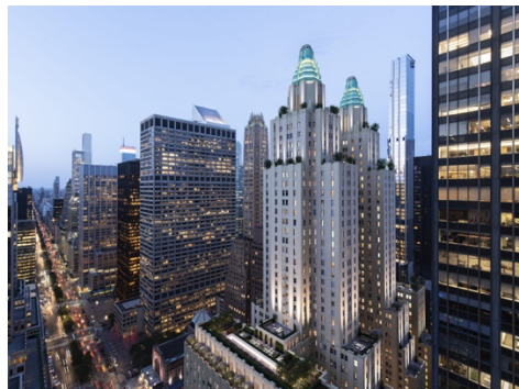
Waldorf Astoria New York. The Towers of the Waldorf Astoria

By Libertina Brandt Impressions: 1,822,100