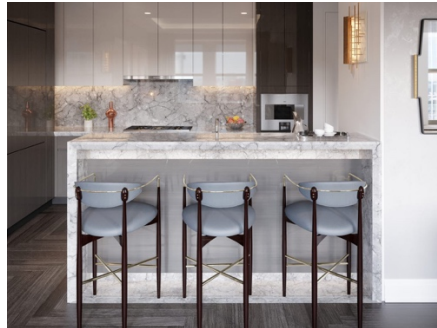
The Towers of the Waldorf Astoria

In addition, residents will also have access to the hotel's 100,000 square feet of amenities.