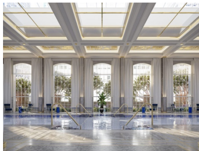
The Towers of the Waldorf Astoria

Residents of The Towers of the Waldorf Astoria will have exclusive access to over 50,000 square feet of amenities.