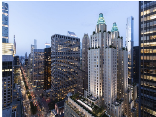
The Towers of the Waldorf Astoria

Manhattan's famous 5-star hotel, Waldorf Astoria New York, is now selling condominiums.