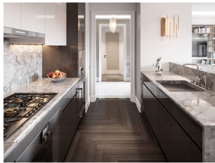
The Towers of the Waldorf Astoria