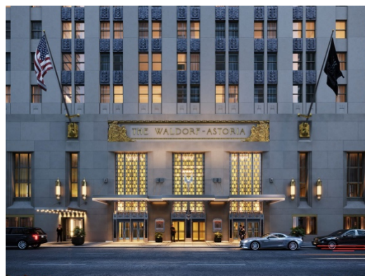
The Towers of the Waldorf Astoria

Currently, 375 rooms are being converted into luxury condominiums. They will be called The Towers of the Waldorf Astoria.