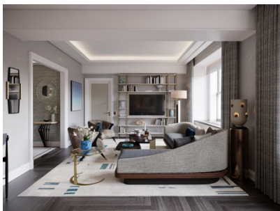
Rendered image of a living room. The Towers of the Waldorf Astoria

The private amenities include a 25-meter pool, 4 private bars, a fitness center, and a billiards room.