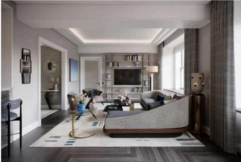
Deniot designed the coffered ceilings with integrated recessed lighting and streamlined moldings that allude to the 1930s origin of the hotel.