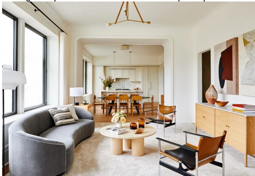
the building has a total of 64 residences

originally built in 1925 by the knights of columbus, one prospect park west is a 10-story classical revival building that served as a clubhouse and hotspot for society events in park slope, brooklyn. sugar hill capital partners tasked multidisciplinary design firm WORKSTEAD with renovating the building to include 64 residences that strike a balance between pre-war and modern design. among a wide range of amenities, residents will enjoy a rooftop meadow designed by ODA — the firm's first landscape-only commission.