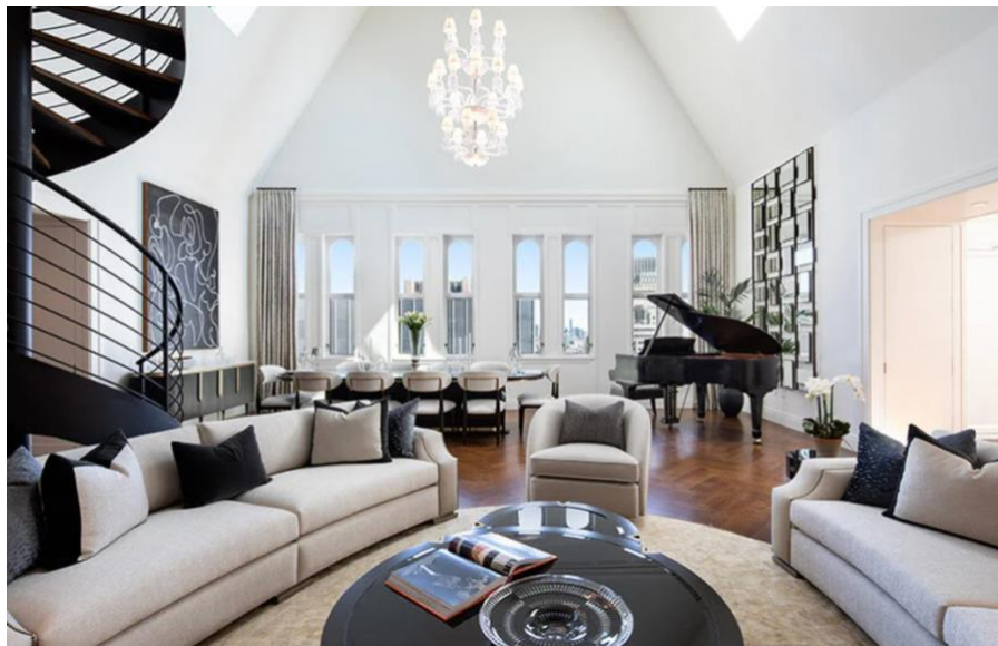
pavilion A is a loft-like 5 bedroom residence | image by travis mark

the woolworth tower residences comprise 32 loft-like condominiums that encompass floors 29 to 58 of the iconic, landmarked woolworth building. designed by cass gilbert, the tower was commissioned by retail magnate frank woolworth and opened in 1913 as the world's tallest building. alchemy properties , the developer behind the project, has paid homage to woolworth by restoring original details to reflect the building's glory days, including a $22 million restoration of the terracotta façade, while simultaneously updating residences with modern-day conveniences. amenities include the gilbert lounge and entertaining area, a wine cellar and tasting room, a modern fitness center, and a 50-foot lap pool.