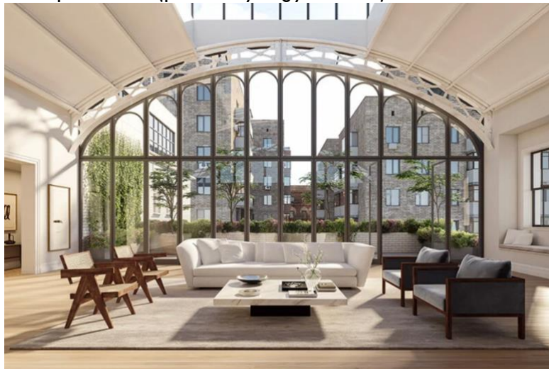
the living room of the 'solarium penthouse'

555 west end avenue is a circa 1908 landmarked beaux arts building designed by william a. boring — known for his work on the immigration station at ellis island in new york. the structure served as a private school before being transformed into a condominium on the upper west side. the building's unique history results in 13 one-of-a-kind homes, each with soaring ceilings and massive original windows. the spaces of the former school have been turned into homes like the 'solarium penthouse' (previously a gymnasium).