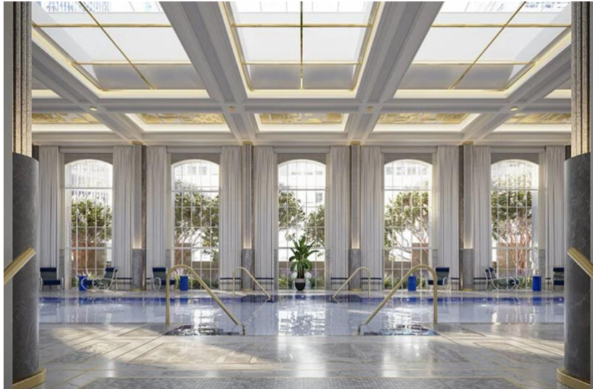
the starlight pool

historic framework. the wide variety of residences range from studios to opulent four bedrooms and penthouses, many with unique floorplans and private outdoor spaces.