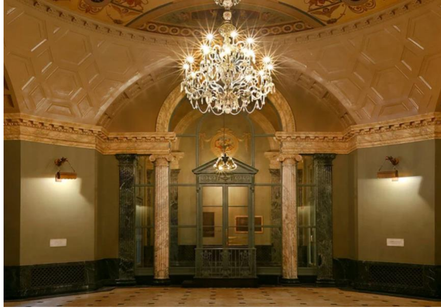
the building's 'rotunda'

for the development's lobby, located inside 'steinway hall', william sofield, founder of studio sofield, took inspiration from the original architecture and collaborated with new york artisans to create interiors reminiscent of the public spaces once featured in classic skyscrapers. abstract painter nancy lorenz created elevator doors inspired by the bronze detailing work found in many new york landmarks, while artist john opella created a gold and silver leaf mural depicting elephants breaking out of the central park zoo. read more about the project on designboom here .