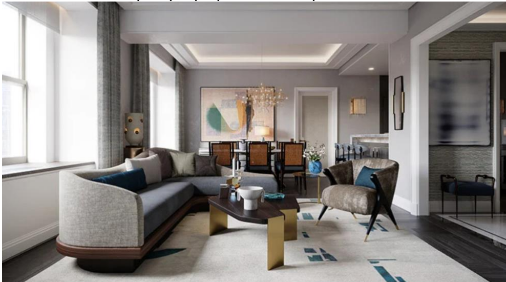
inside one of the residences at the towers of the waldorf astoria

residents will have access to over 50,000 square feet of private residential amenities. these range from health and wellness to entertaining and business spaces, including a 25-meter pool, state-of-the-art fitness center, private spas for men and women, and numerous entertaining spaces to support private functions. the towers of the waldorf astoria will offer 375 residences starting from $1.8 million. occupancy is projected for early 2023.