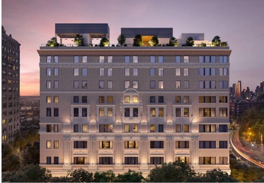
one prospect park west was originally built in 1925 by the knights of columbus

originally built in 1925 by the knights of columbus, one prospect park west is a 10-story classical revival building that served as a clubhouse and hotspot for society events in park slope, brooklyn. sugar hill capital partners tasked multidisciplinary design firm WORKSTEAD with renovating the building to include 64 residences that strike a balance between pre-war and modern design. among a wide range of amenities, residents will enjoy a rooftop meadow designed by ODA — the firm's first landscape-only commission.