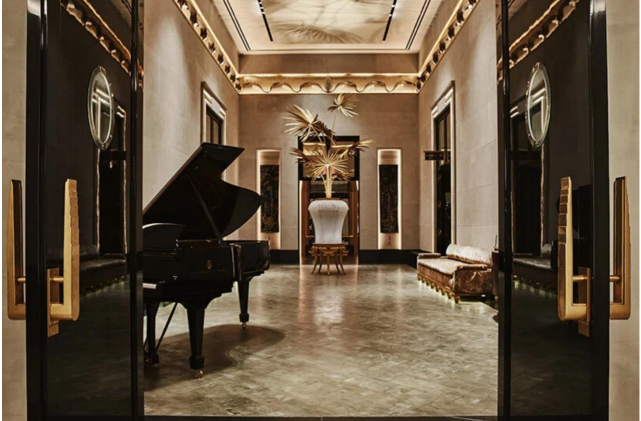
lobby with door handles that reference the form of the skyscraper above | image by adrian gaut

the project also includes 'steinway hall', originally designed by warren & wetmore — the architects behind new york landmarks such as grand central station. originally completed in 1925, the building has now been comprehensively re-imagined by SHoP and studio sofield to include a limited collection of light-filled, pre-war residences that honor the heritage and integrity of one of midtown's most cherished landmarks.