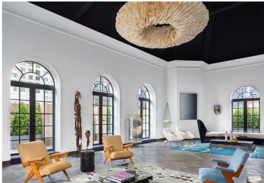
the living room of the landmark penthouse