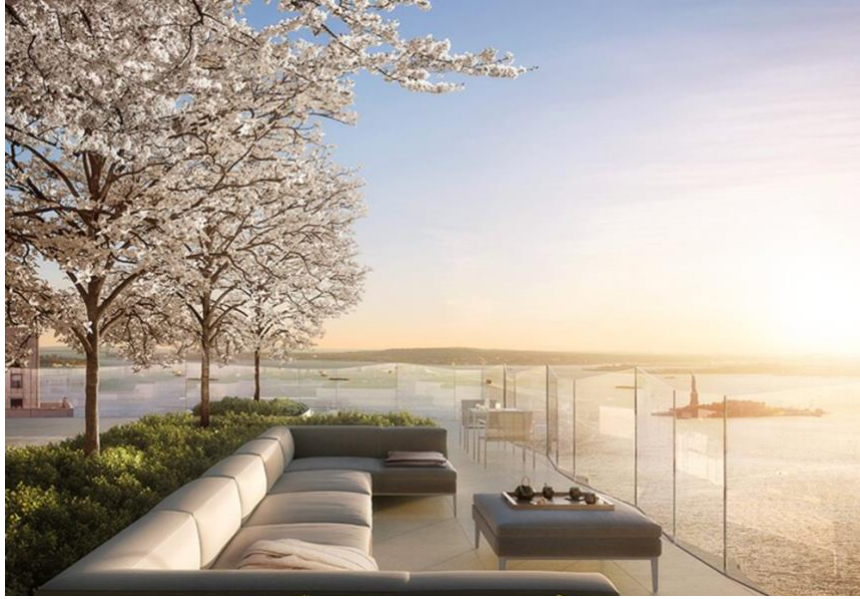
the rooftop overlooks the statue of liberty | image by DBOX for macklowe properties

in 2014, macklowe properties acquired the property and tasked architecture firm SLCE with converting the landmark building into residences with retail outlets at its base. in total, the renovated building will house 566 condos and a suite of amenities that includes an athletic club, a full-floor event and entertainment space, and spa services. residents are expected to begin moving in in late 2021, with the project's full completion scheduled for late 2022. see historical photos from ralph walker's archive here , as well as images detailing the red room's restoration, and renderings of the soon-to-be-complete development.